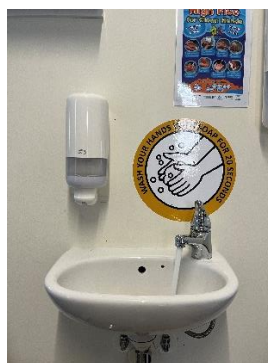
Figure 2. Health Room