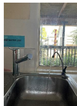
Figure 3. Hall Kitchen