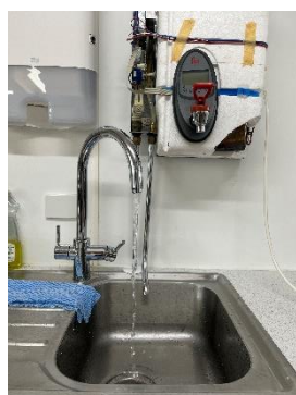
Figure 1. Staff Room

Following collection, samples were refrigerated (not frozen) and stored in a chilled, dark container with ice packs to maintain temperatures below 10°C. All samples were labelled with the date and time of collection and transported to the laboratory within 24 hours.